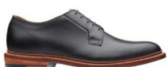
No16 PLAIN BLACK LEATHER

The original shoemakers with historic roots. Our New England shoemakers crafted their first styles in 1899, and since then, no other shoe company has understood men better than Bostonian.