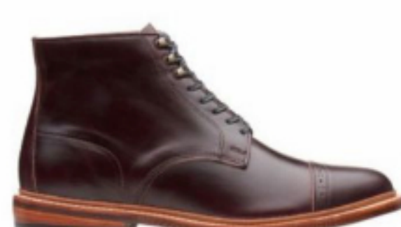
No16 CAP BURGUNDY LEATHER