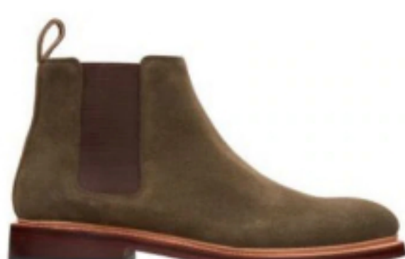
SOMERVILLE HI OLIVE SUEDE